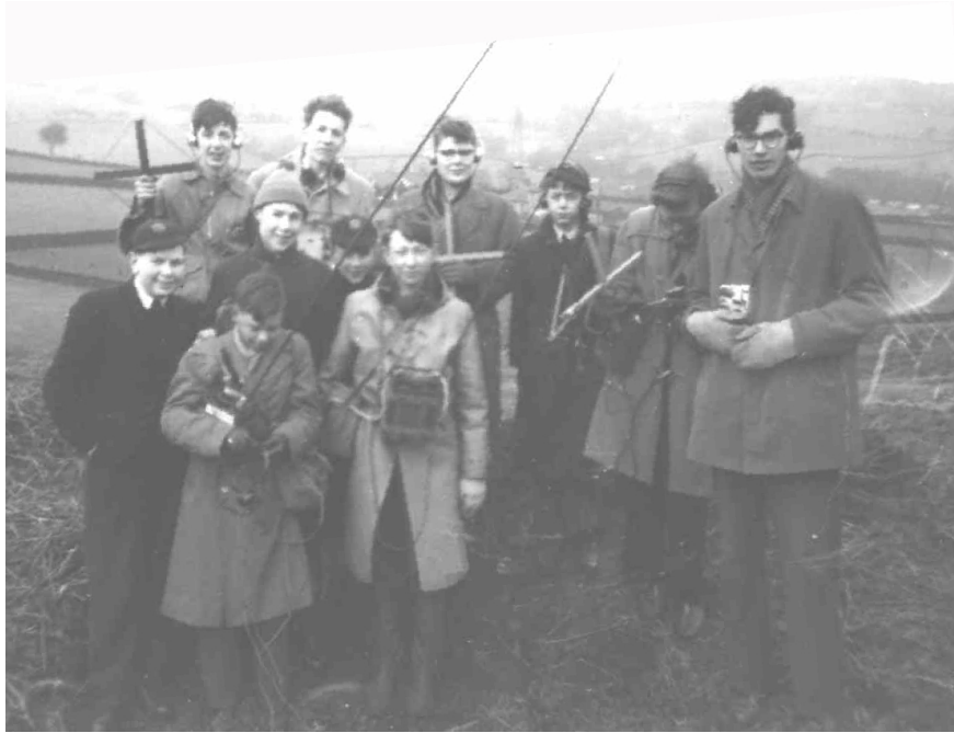
Direction Finding competition on Baildon Moor in Spring 1958